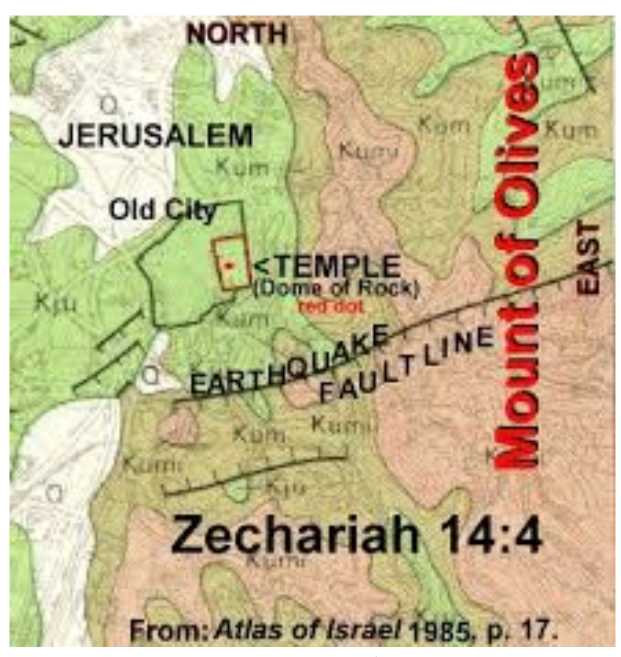
Earthquake Fault Runs through the Mount of Olives<sup>1</sup>