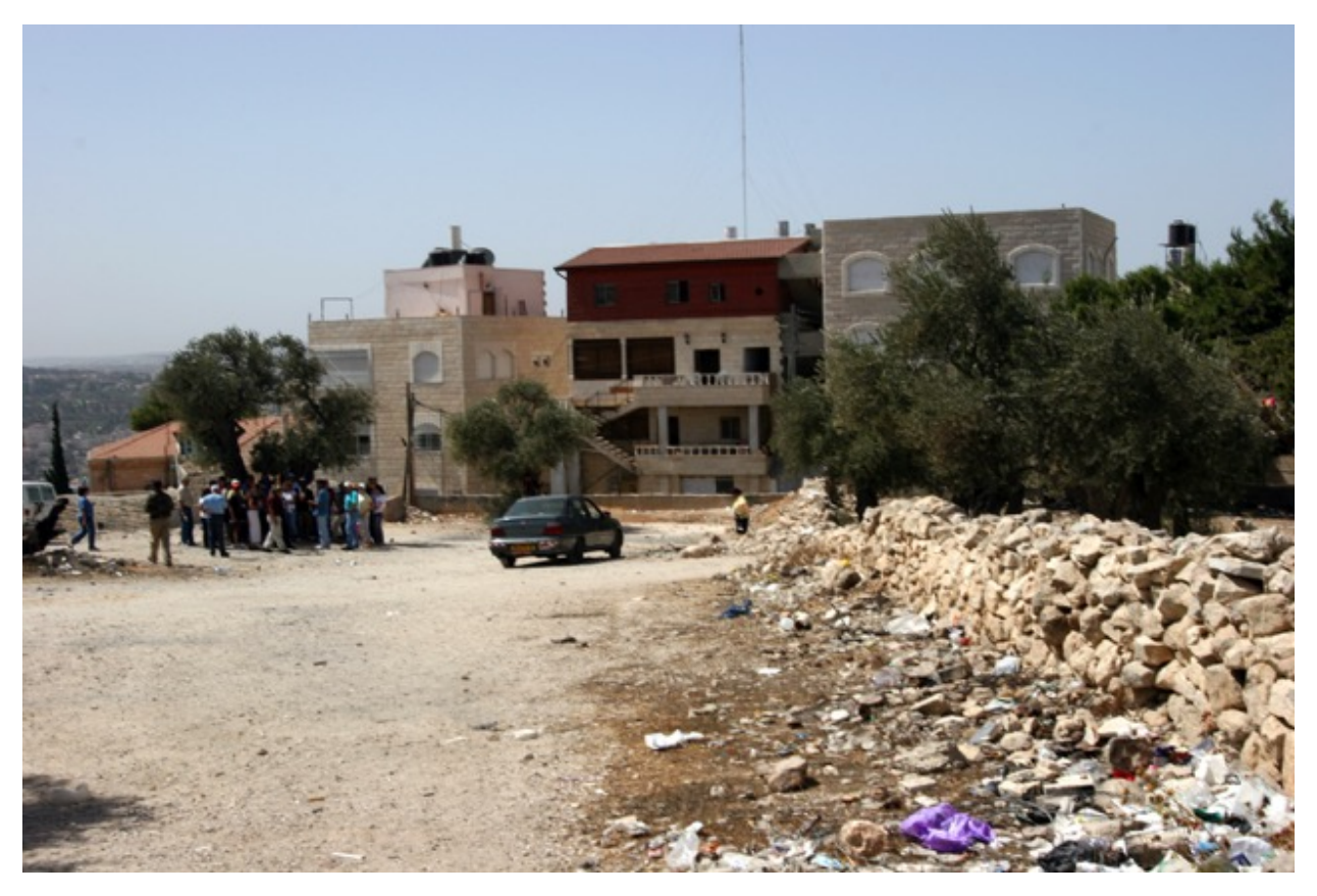
Crucifixion Site: Our Messengers of Messiah Israel tour group gathered around one of the Two Olive Trees. Note the presence of many rocks that could be used to stone the Two Witnesses.