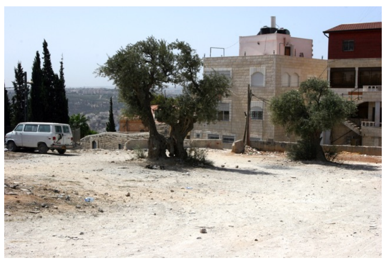
The Two Olives Trees at the Crucifixion Site: The two trees are aligned along an East-West line pointing to the Temple Mount. They are located across the street from the Jewish residence and Choshen Synagogue, the two buildings behind the two trees.