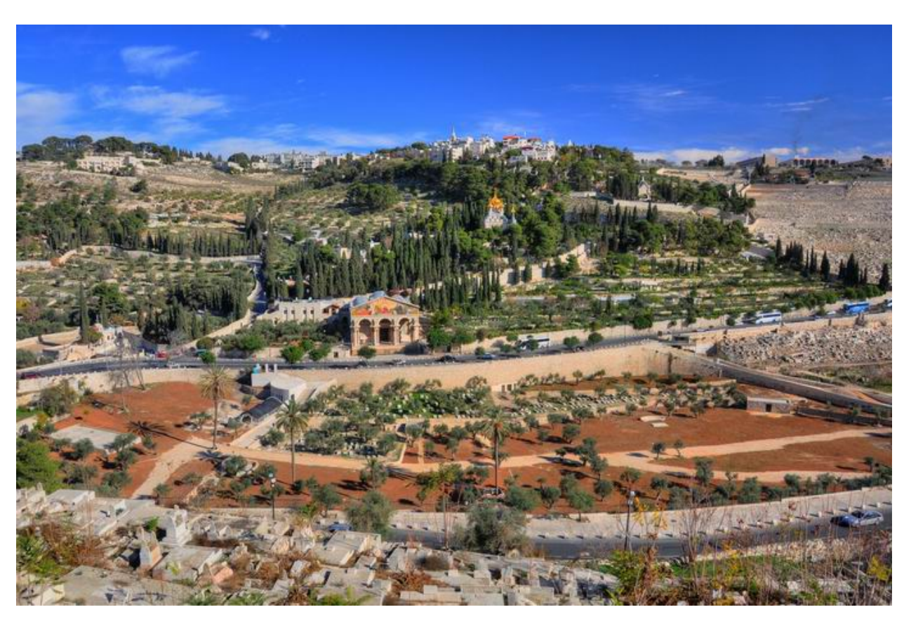
The Mount of Olives<sup>3</sup>

The Mount of Olives is one of three peaks of the mountain ridge that runs for 2.2 miles east of the Old City of Jerusalem: The northern peak, Mount Scopas, 2,710 feet; the central peak, Mount of Olives, 2,684 feet; and the southern peak, Mount of Corruption, 2,451 feet.<sup>4</sup>