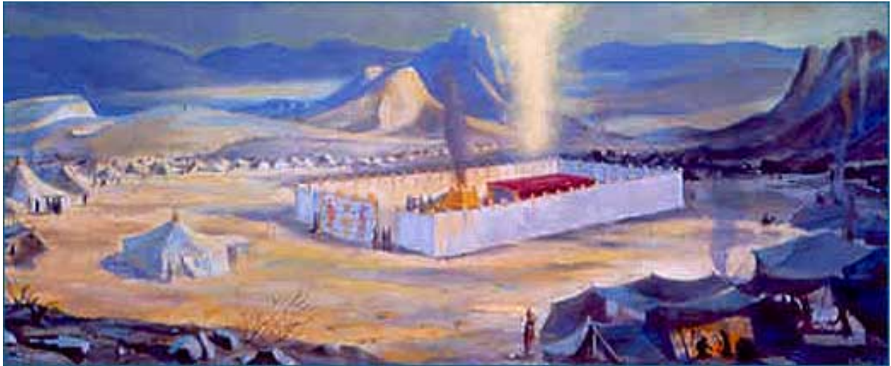
Illustration: The Tabernacle in the Wilderness with the Shekinah (Glory Cloud) 11

The Shekinah (Glory Cloud) filled the Tabernacle: